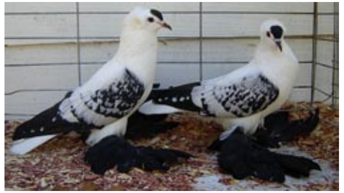
Black Spangle Fairy Swallows bred by Perry Mueller