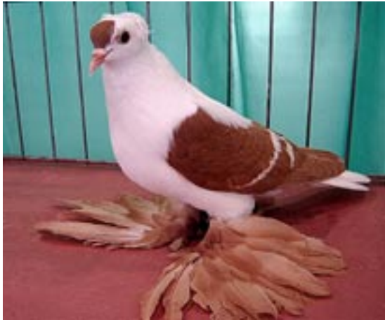
Nate Wayne's Yellow White Bar Fairy Swallow rated S-95