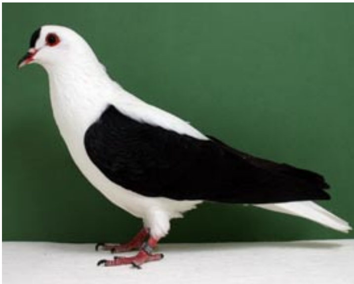
Black Barless Thuringer Wing Pigeon by Jay Beals rated "E" and Best Thuringer Wing Pigeon.