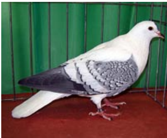
Elliot Yeske's Blue Spangle Thuringer Wing Pigeon rated S-94