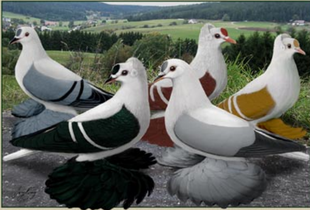
Saxon Wing Pigeons