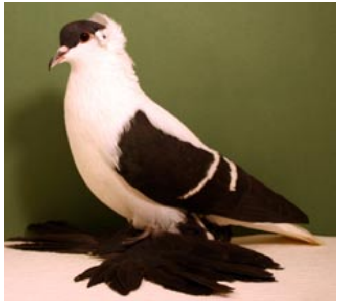
Black White-bar Fullhead rated S-95 Bred by Bill Griebel Sr.