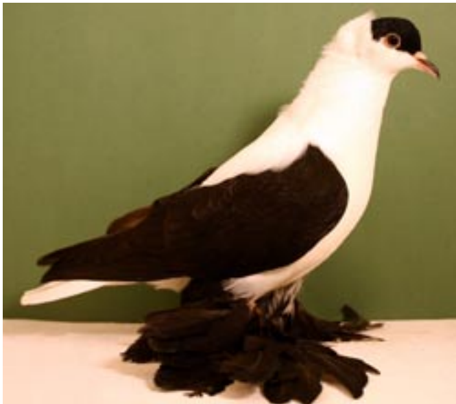
Black Barless Fullhead rated S-95 Bred by Bill Griebel Sr.