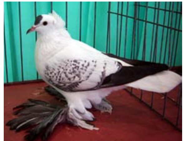
Chris Lindom's Blue Spangle Fairy Swallow rated S-94