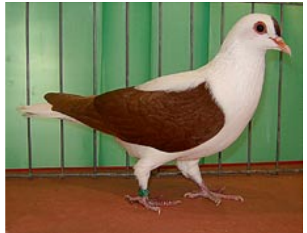
Gerald Kress' Best Thuringer Wing Pigeon rated HS-96