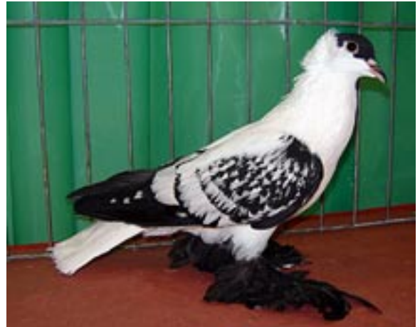
Elliot Yeske's Black Spangle Fullhead Swallow rated S-94