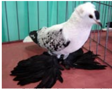
Perry Mueller's Black Spangle Fairy Swallow rated HS-96