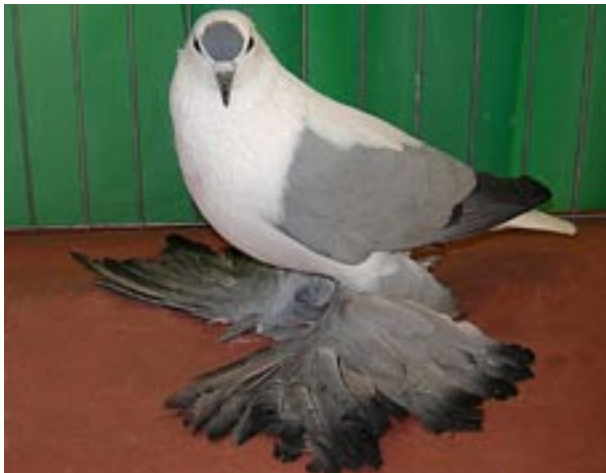
Perry Mueller's Best Young Swallow; Blue Barless rated E-97