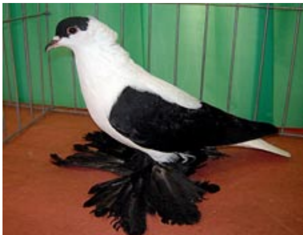
Chris Lindbaum's Best Fullhead Swallow; Black Barless rated S-95