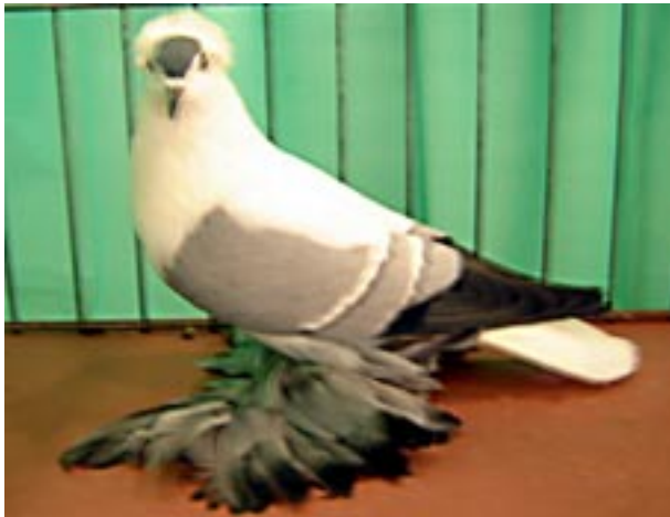
Mike Swanson's Best Fairy Swallow.; Blue White Bar rated E-97