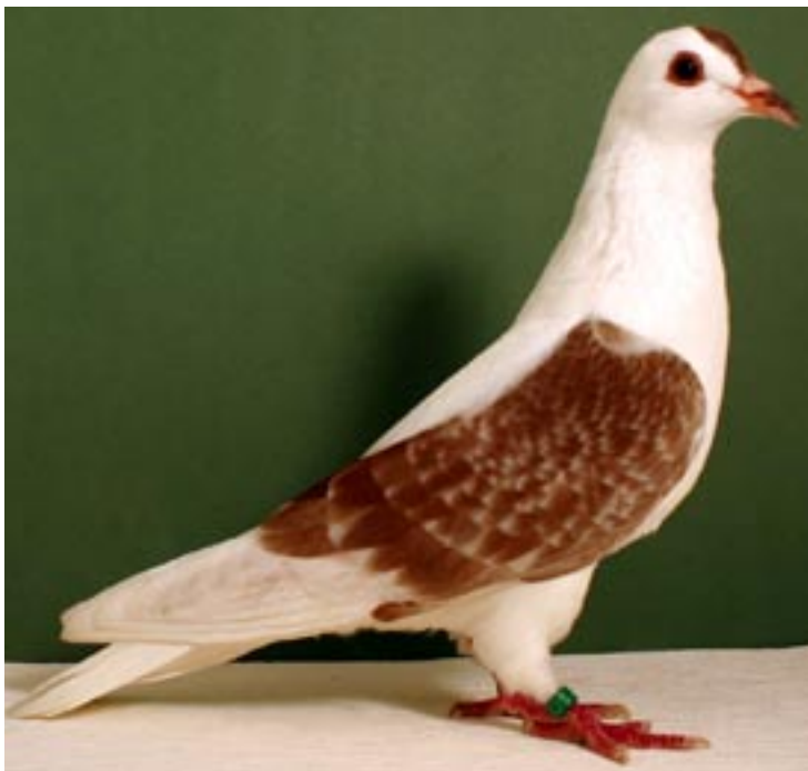
Red Check Thuringer Wing Pigeon bred by Dave Holloway rated S-95